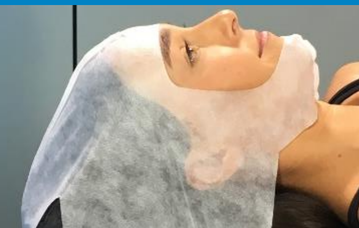
Head stabilization with the iFIX Head Mask