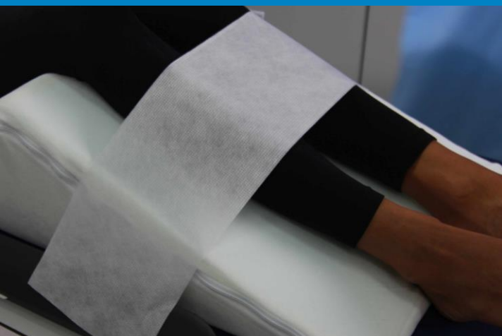
Lower extremity stabilization