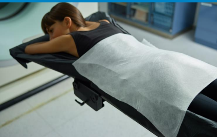
Hip and lower spine stabilization